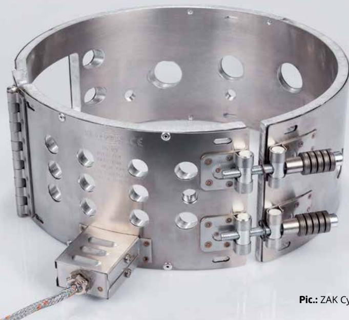
Pic.: ZAK Cylinder Band type